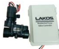
Residential Purge Valve